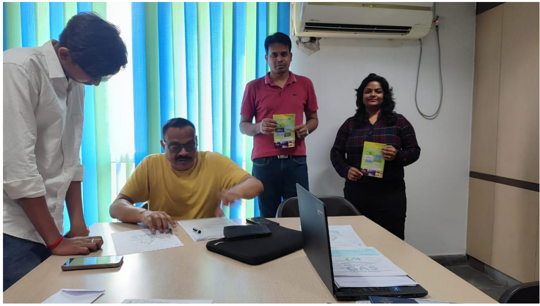
Meeting with Facility Manager & Expediting the Registration & awareness activities for DPNG at Uniworld City.