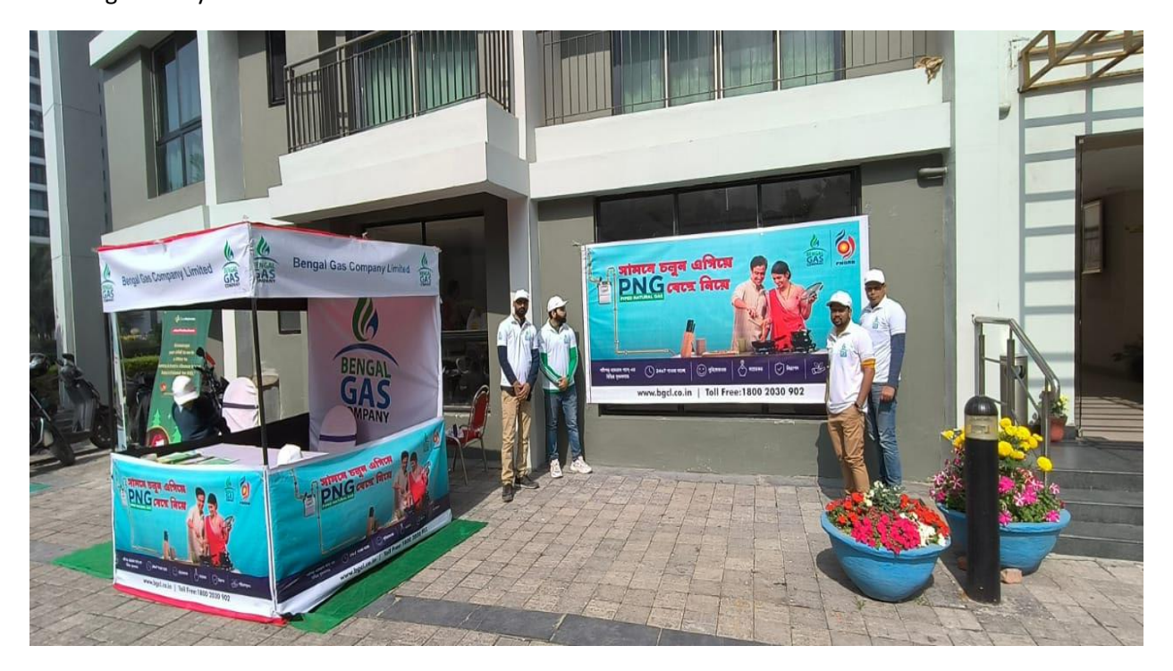
BGCL's DPNG registration kiosk and banner ensures a smooth start to the Rosedale Society DPNG enrolment activity.

Paving the way for a cleaner future: BGCL's initiative towards PNG National Drive.