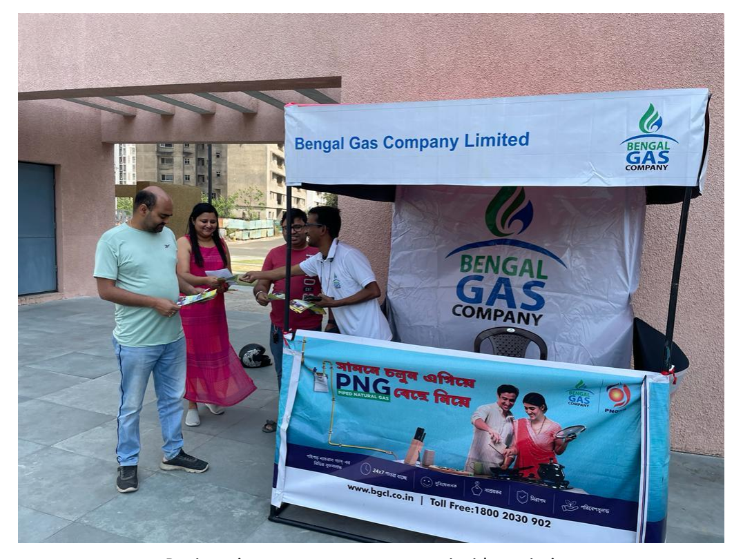
Registration cum awareness camp inside societies.