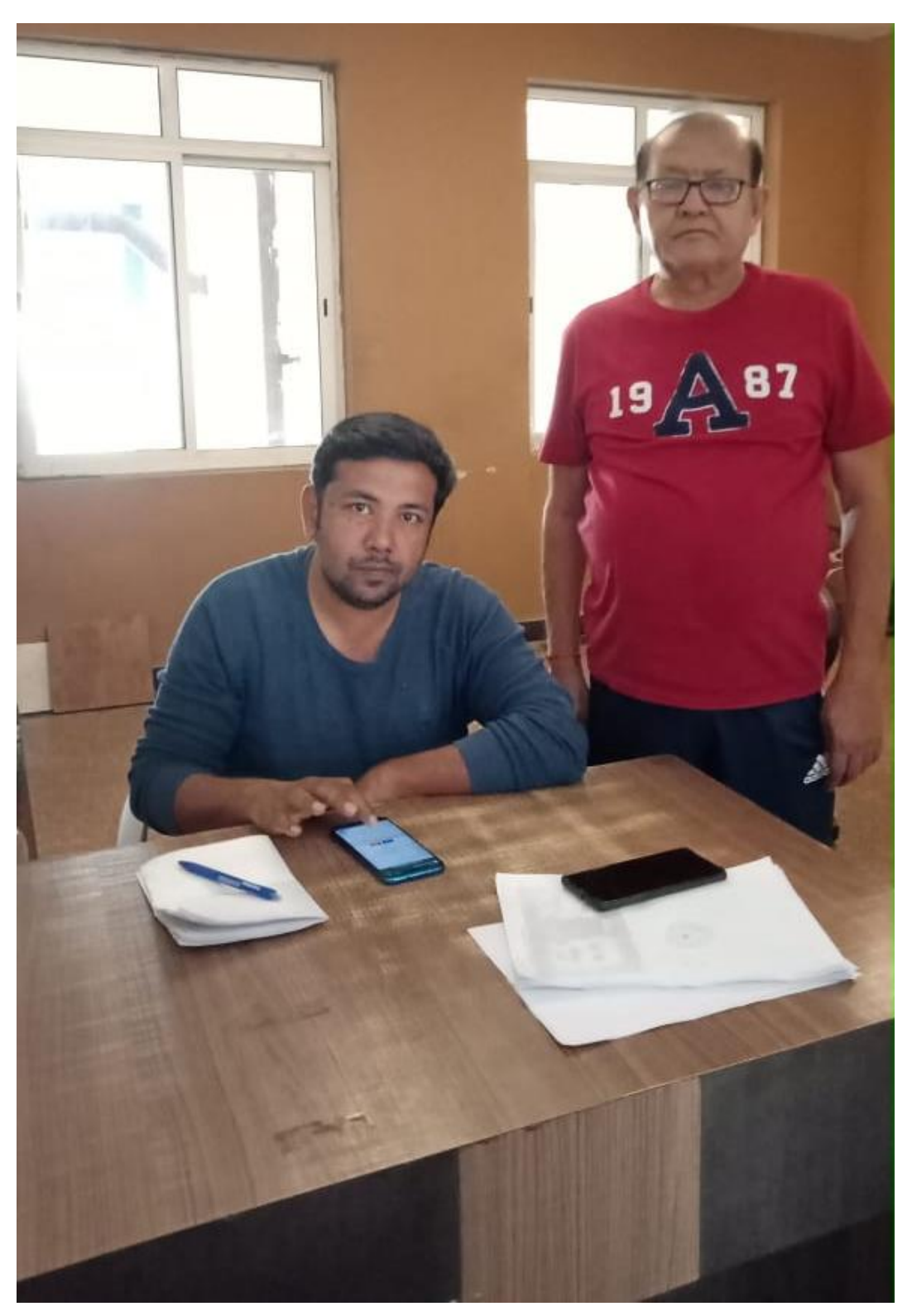
Customer onboarding activity @ Uniworld Society.