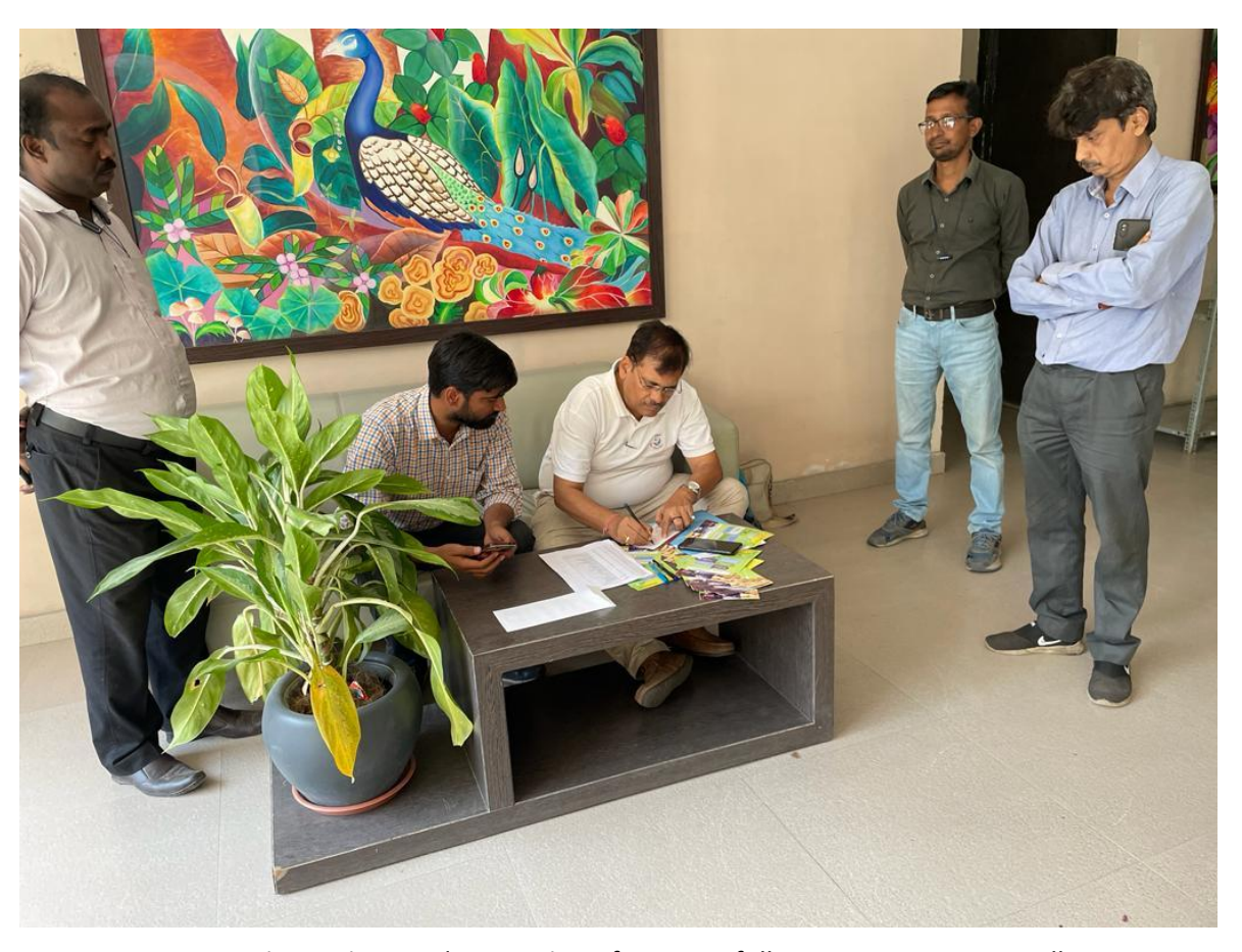
Registration activity and promotion of DPNG in full swing at Newtown, Kolkata