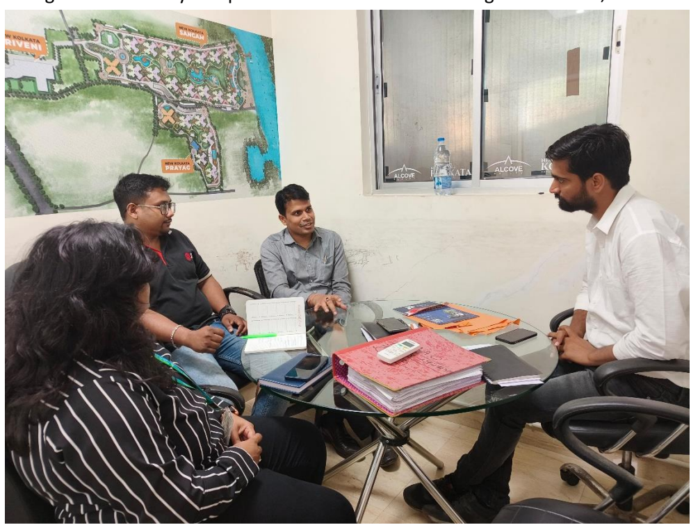
Meeting with Alcove Society, Hooghly to mark the beginning of DPNG registration and commissioning.