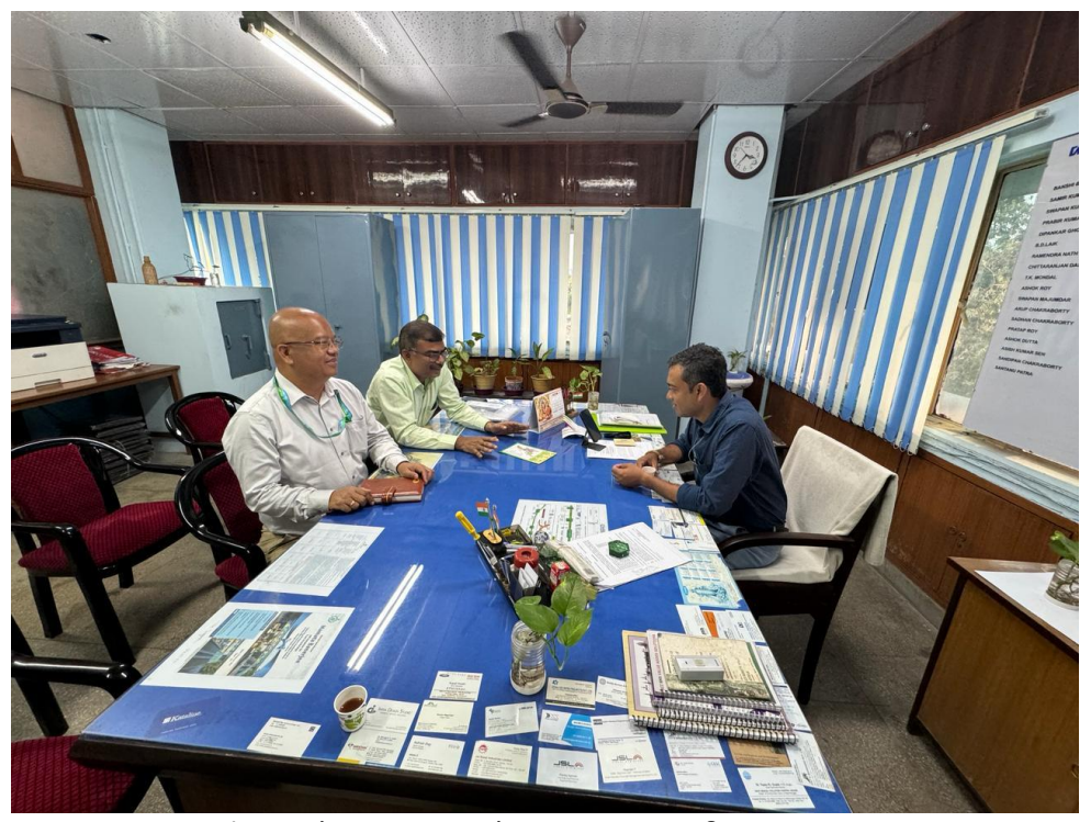
Meeting with Superintending Engineer, R & B sector, KMDA