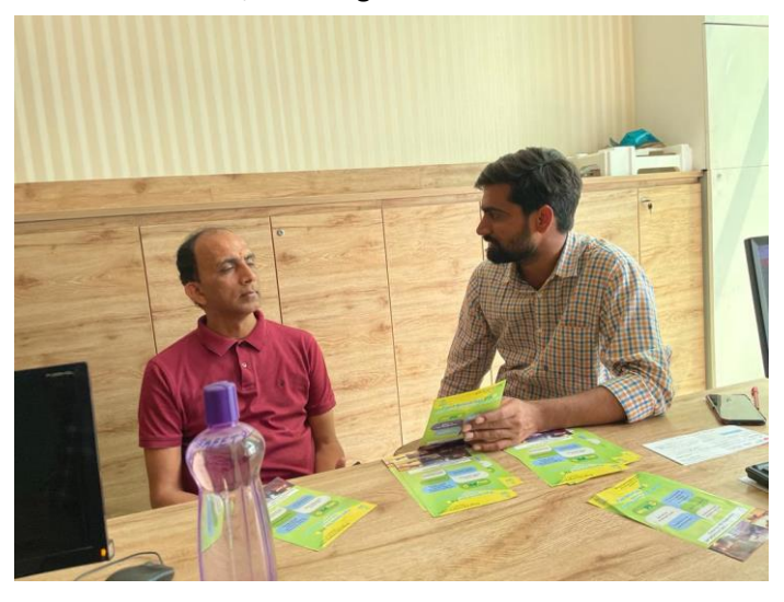
DPNG Registration proceedings at Rosedale Gardens

Bats, balls, and business brilliance collide at Corporate cricket tournament showdown hosted by BGCL, boosting DPNG awareness.