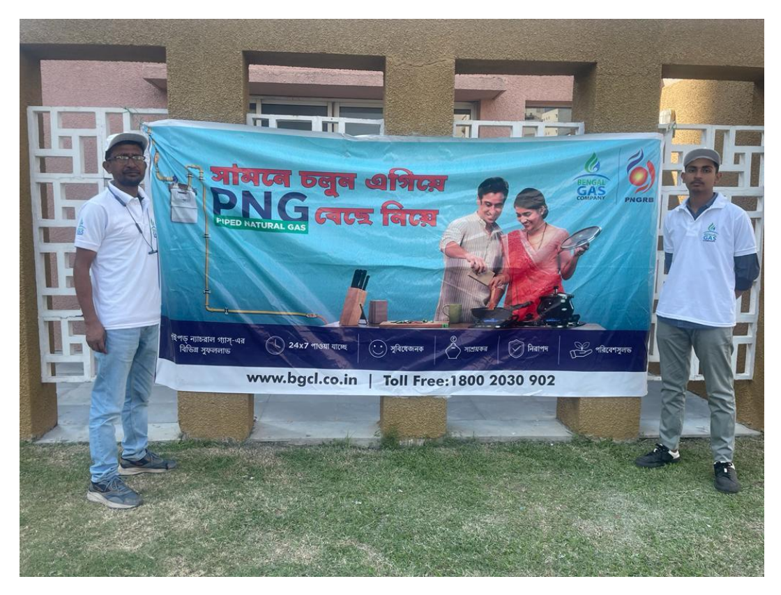
BGCL extends warm welcome to new residents, inviting them to embark on their DPNG journey at the registration booths.