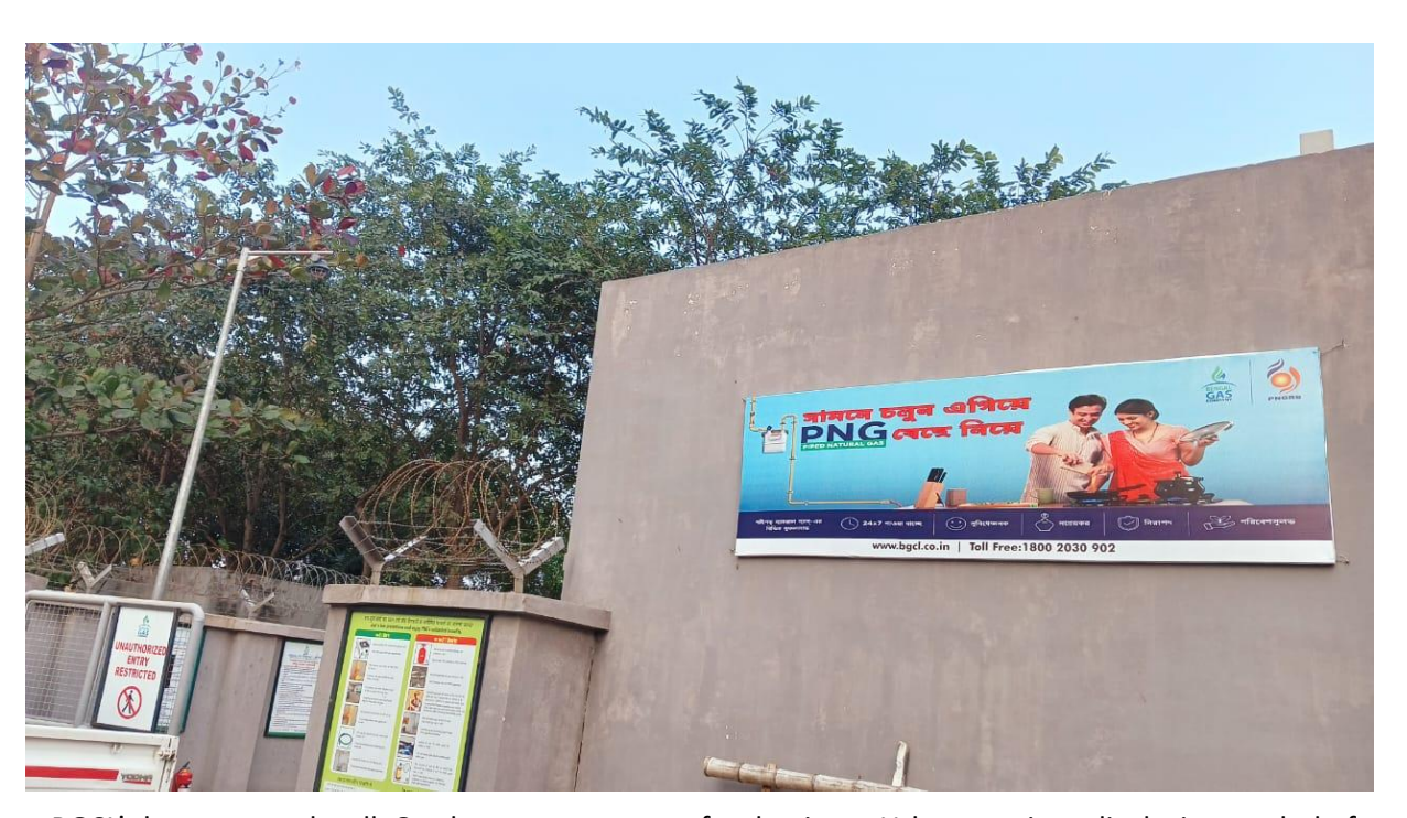
BGCL's banner stands tall. Our banner serves as a focal point at Urbana society, displaying symbol of connection and community for approx. 1200 residents.

Our banner catches the eyes of commuters at BGCL's CNG station within WBTC Bus depot.