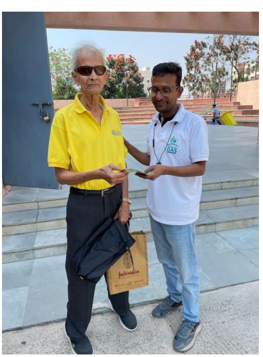
Registration and leaflet distribution at Uniworld City