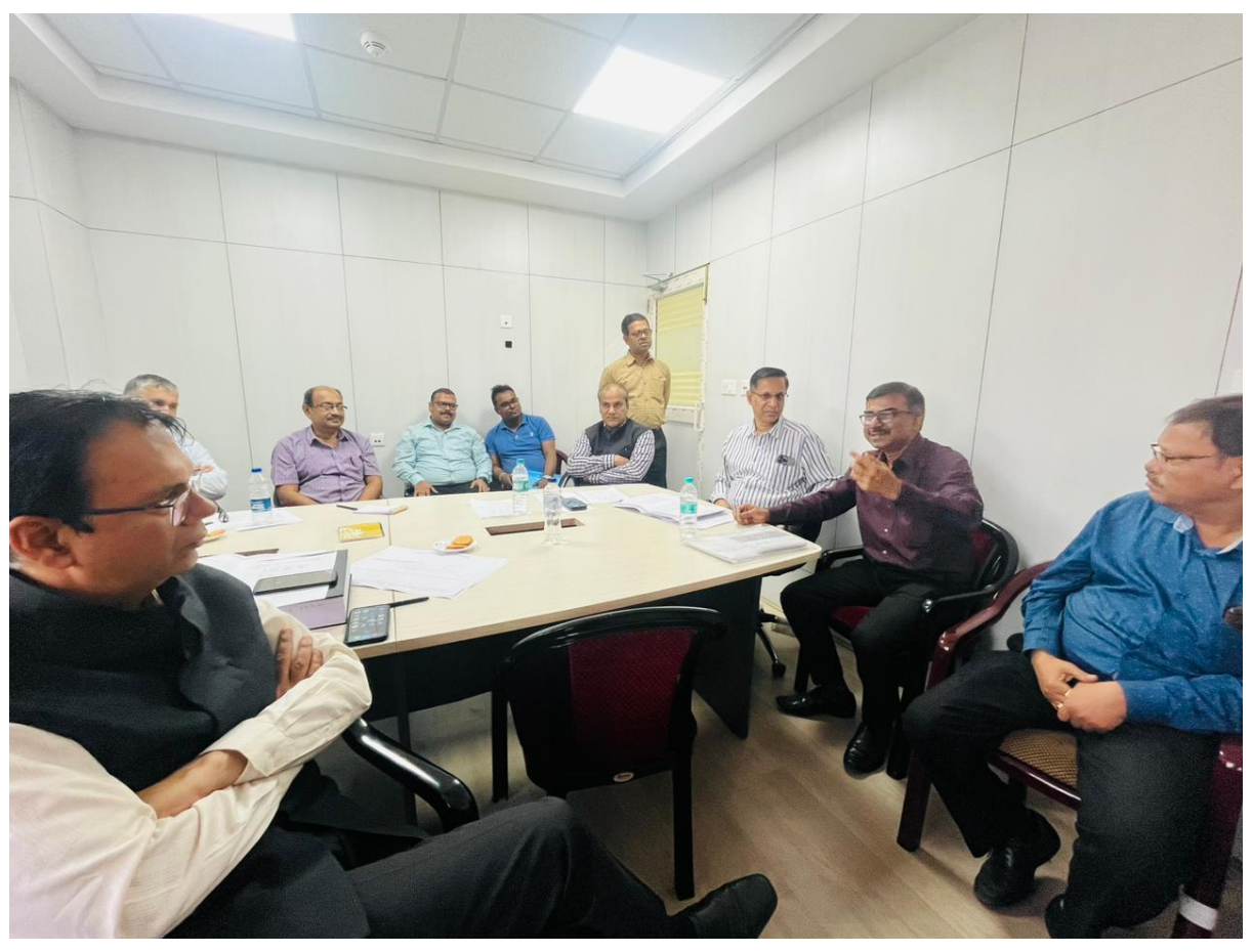
\label{lem:meeting with WBHDCL officials regarding DPNG benefits.}