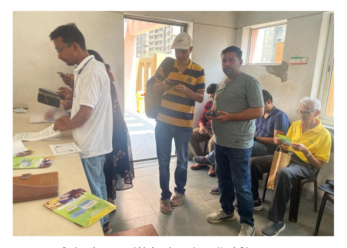
Registration camp within housing society at North 24 parganas.