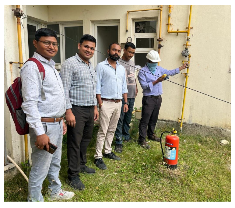
Safety Awareness campaign carried out at Housing Societies at Newtown, Kolkata.