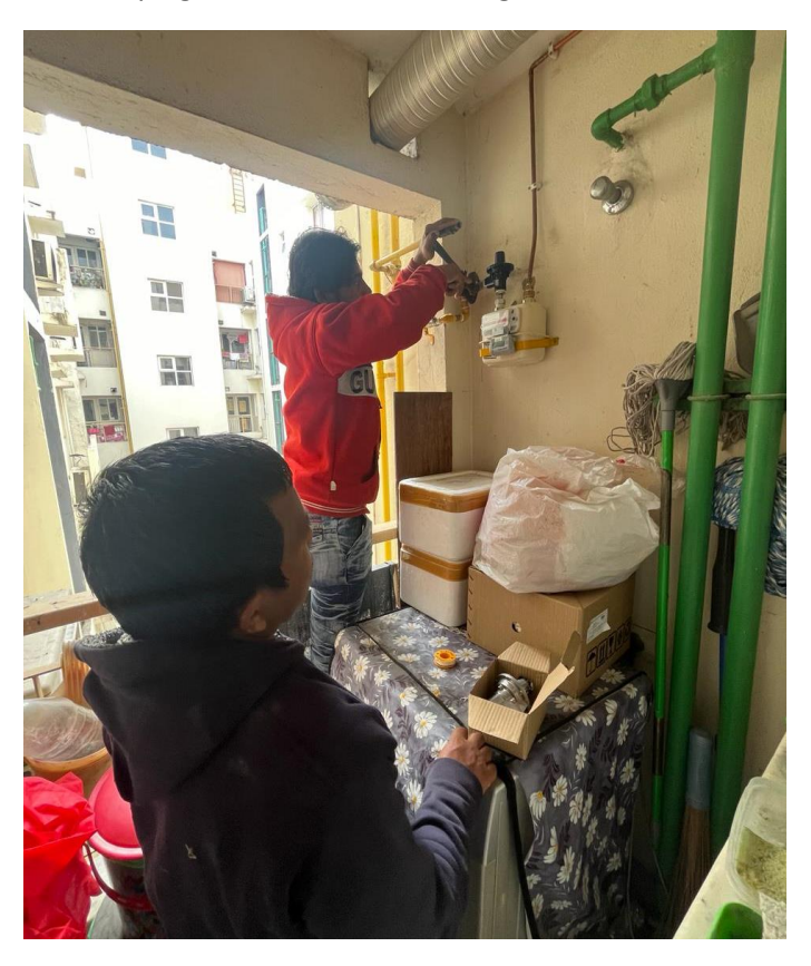
Providing new connection at Housing Societies at Newtown, Kolkata.