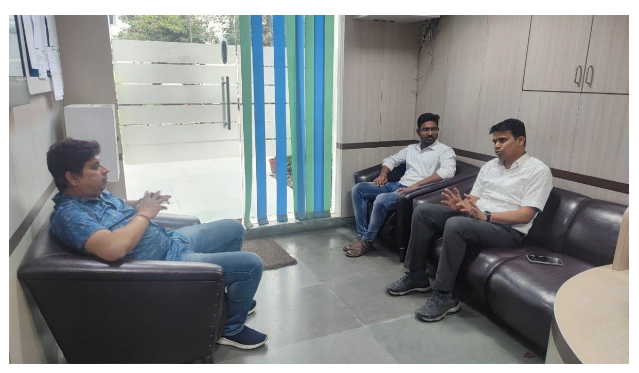
Meeting with Uniworld City Society to host DPNG registration camps, ensuring increased awareness among households and maximize DPNG registrations.