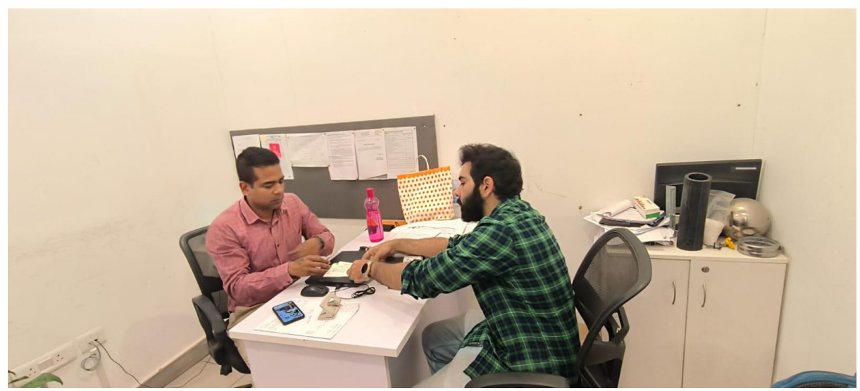
Meeting with Urbana Society Facility Management to streamline bulk consumer registration activity.